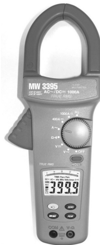
MW 3395 MW 3390 MW 3380