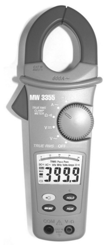
MW 3350 MW 3355