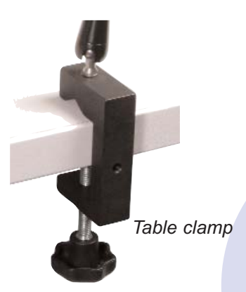
Table Clamp - Ergonomically

The table clamp is the ergonomically version for fixing the 3D Probe Positionier (clamping range up to 40mm). The table clamp is the ideal solution for installation of the 3D Positioner at table edges and pipes and can be installed and used both horizontally and vertically.