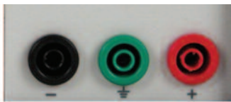
The 9120 series uses 4mm sheathed banana jacks that accept sheathed or shrouded banana plugs and meet the latest international safety standards.