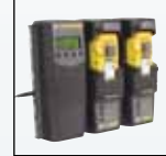
MicroDock II compatible