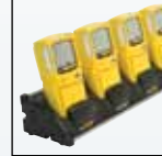
Multi-unit cradle charger