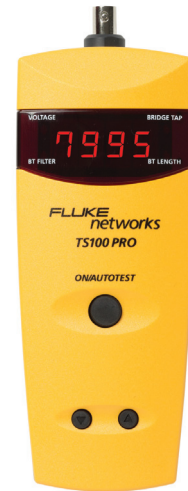
Open/short circuit detection – up to 8,000 feet (2,400 metres)