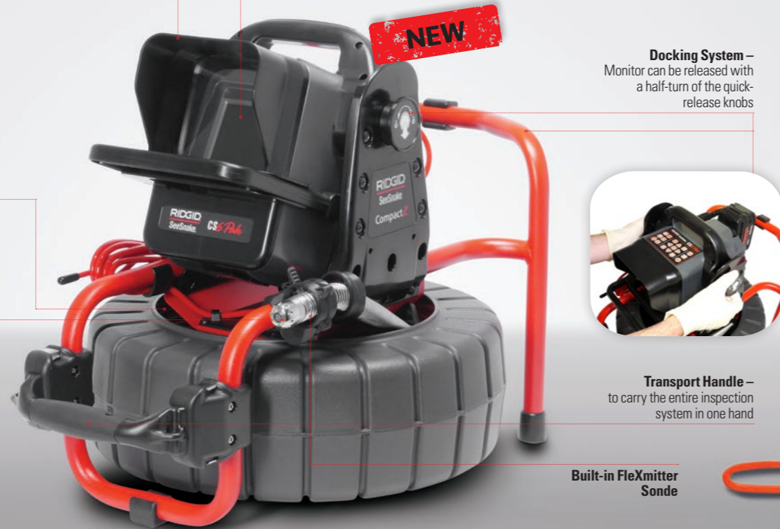
Docking System – Monitor can be released with a half-turn of the quick-release knobs