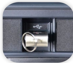
Direct-to-USB Recording (8 GB USB key included)