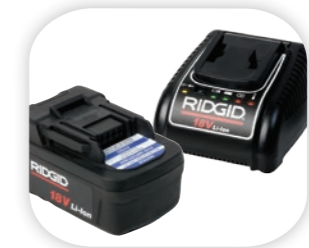
Rechargeable 18 V Advanced Lithium 4.0 Battery