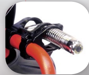
25 mm Self-Leveling Camera