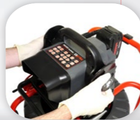
Transport Handle – to carry the entire inspection system in one hand