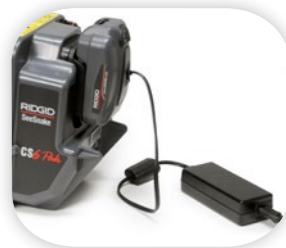
AC Battery Adapter (optional)