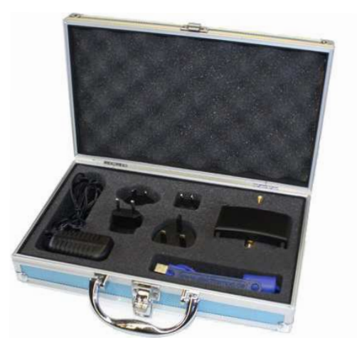
Scope of delivery: transport case, international12V power supply, USB Cable, SMA/SMA (f/f) Adapter, SMA Tool, PC Software, Calibration data

With the very compact dimensions of just 80x50x30 mm and weighing only 150 grams, the BPSG series is predestined for mobile use and fits in every pocket. The compact form factor makes the BPSG the world's smallest battery-powered RF generator up to 6GHz.