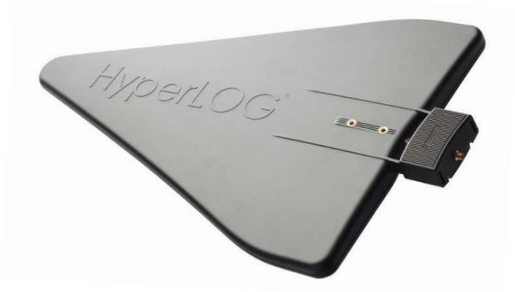
The BPSG as Field-Strength-Generator up to 3V/m (1m distance), available as "DFG 4060"