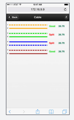
Cable Test and Flash Port available on Mobile UI