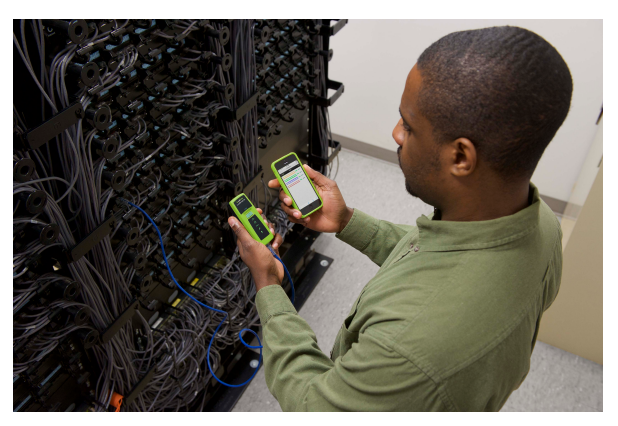
LinkSprinter and Mobile Device Application Shot

LinkSprinter can be paired with a mobile device to reveal more information about the network test! First, connect to the LinkSprinter as a short-range Wi-Fi access point. Then, open your browser on your mobile device and type in the address 172.16.9.9. The webpage will allow you to view more detailed information, such as port name, model, server address, and more. When connected with Link-Live, you can also add comments to your testing results for further documentation.