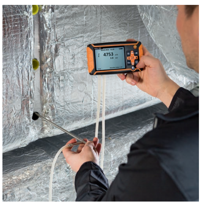
Removable instrument allows Pitot tube measurements in ducts (Pitot tube available separately)