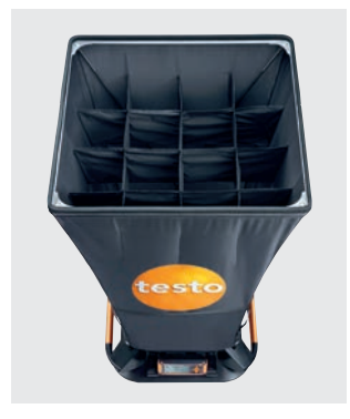
Flow straightener for significantly more precise measurements at swirl outlets.