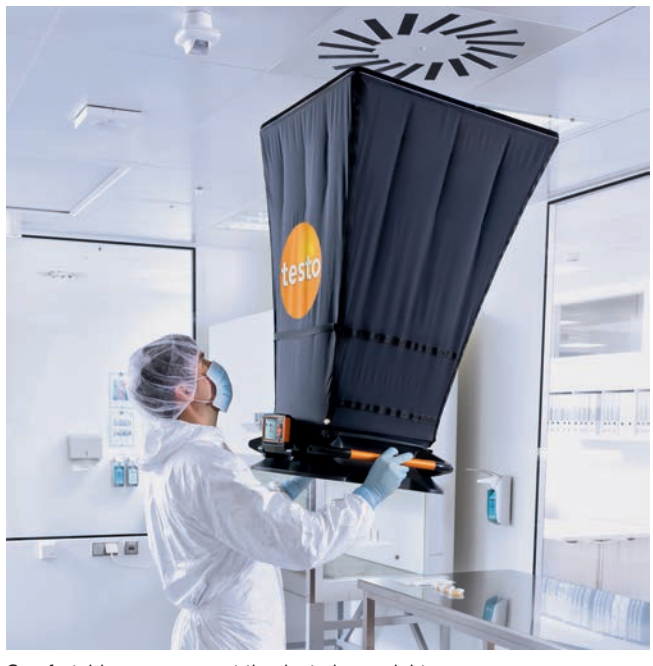
Comfortable measurement thanks to low weight