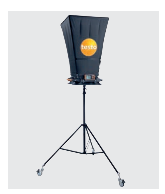
Stable, wheeled tripod with central fitting for secure working at high ceiling outlets.