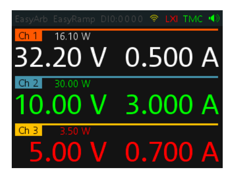
The different operating conditions are indicated by colors (example: R&S®NGE103B).