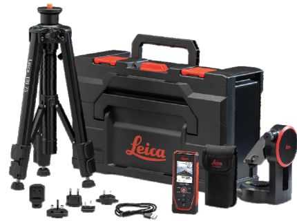
Leica DISTO™ D5 Package Art. No. 950879

Leica DISTO™ D5, Pouch, USB-C to USB-A Cable, Hand Loop, Quick Start Guide, Warranty card, Safety Manual, Calibration Certificate Silver