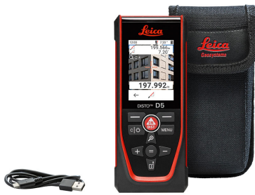
Leica DISTO™ D5 Art. No. 950908

Leica DISTO™ D5, Pouch, USB-C to USB-A Cable, Hand Loop, Quick Start Guide, Warranty card, Safety Manual, Calibration Certificate Silver