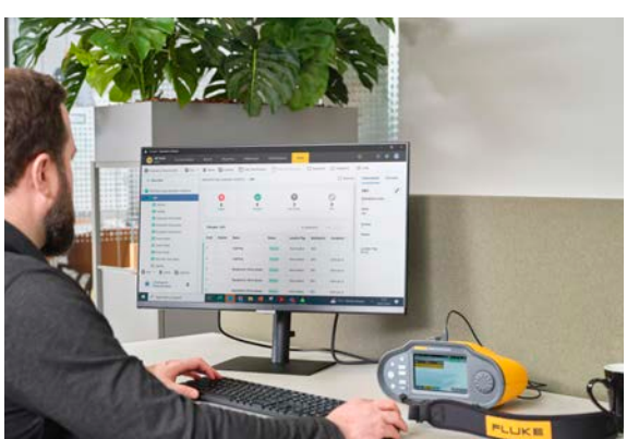
TruTest Software simplifies electrical system data management and reporting