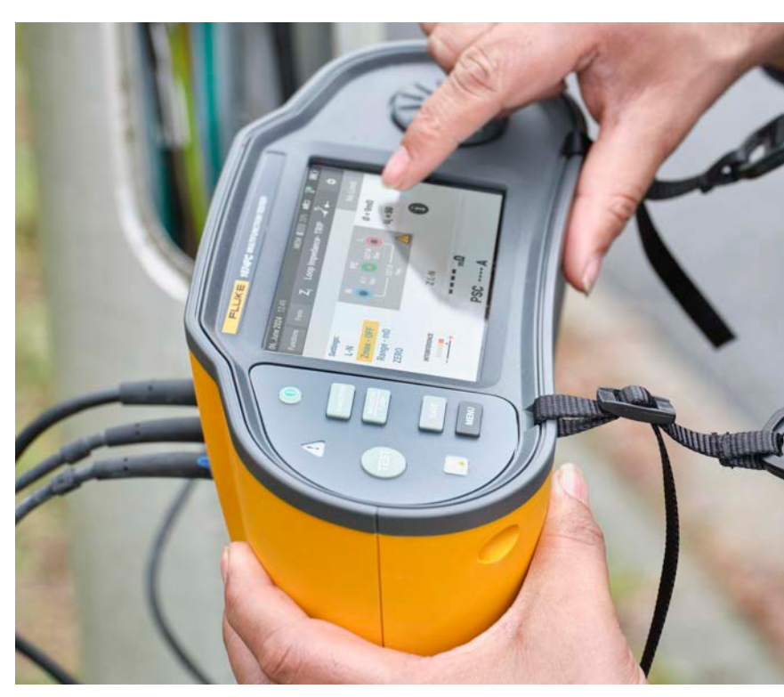
Full-color touch screen and tactile rotary knob for fast navigation

With the 1670 Series, you'll be able to perform your required testing faster and reduce the time you spend on documentation, all while having the ultimate confidence in the data you're collecting.