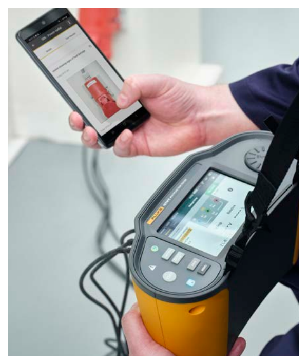
Assign photos directly to specific test points for more detailed documentation