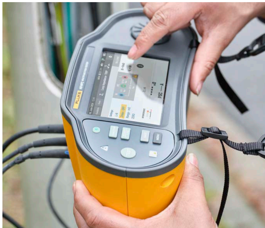
Full-color touch screen and tactile rotary knob for fast navigation

Simplify report generation with automatic report population, Fluke Connect integration, and one-touch reporting with Fluke TruTest™ software.