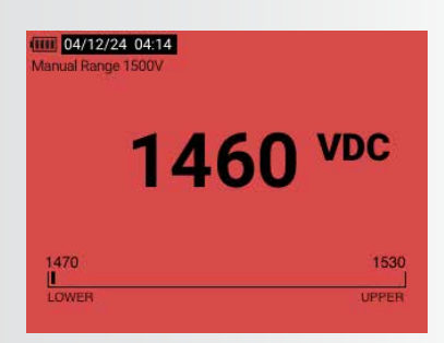
Limit gauge - outside of range